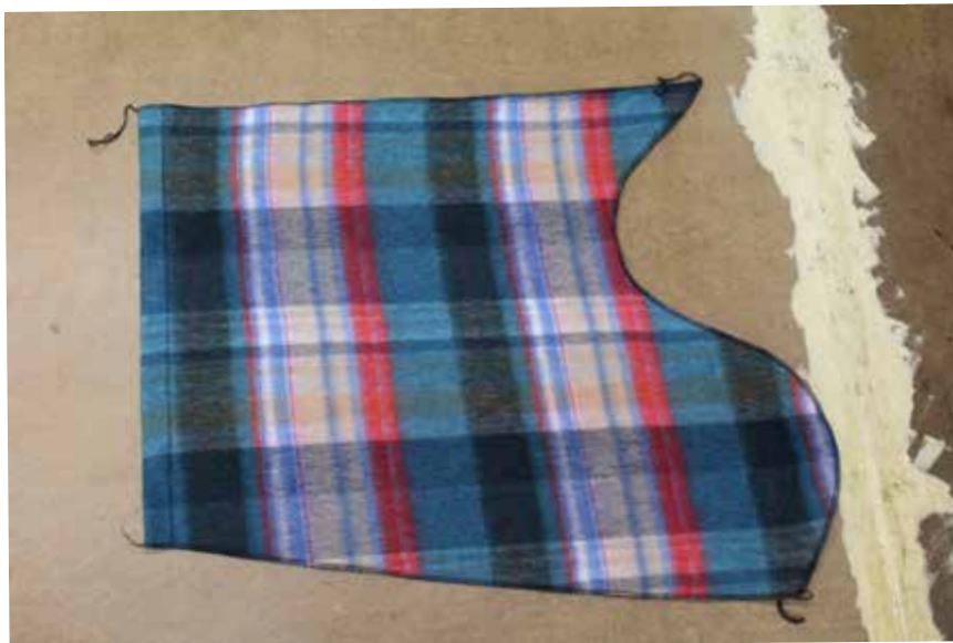
Serge remaining raw edges of self and lining together and press well