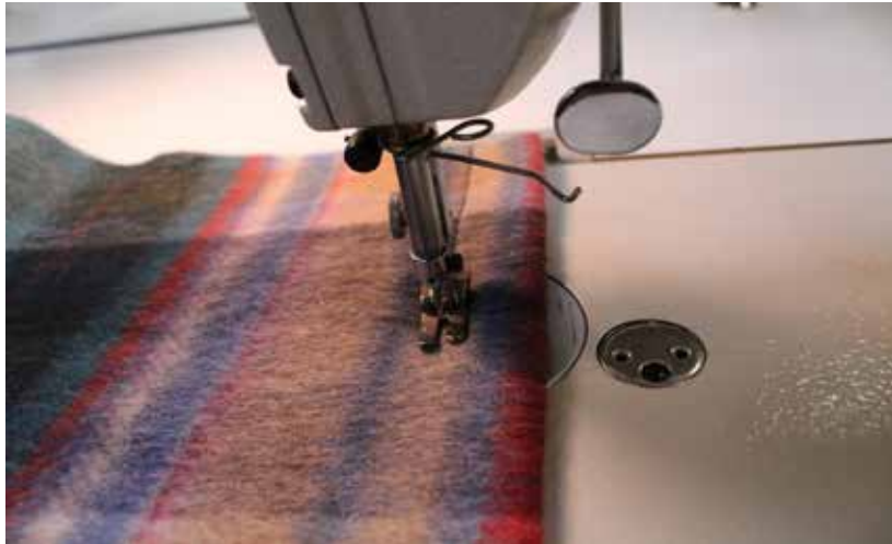
Top stitch hem at 3/4