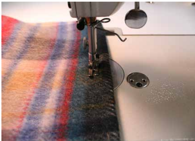
Top Stitch hood centre front at 3/4