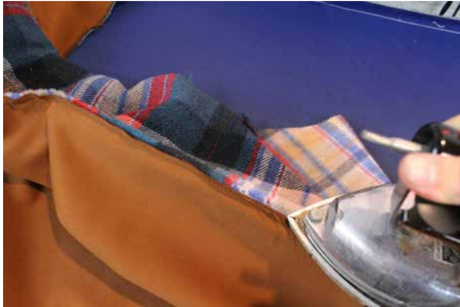
Press open all around