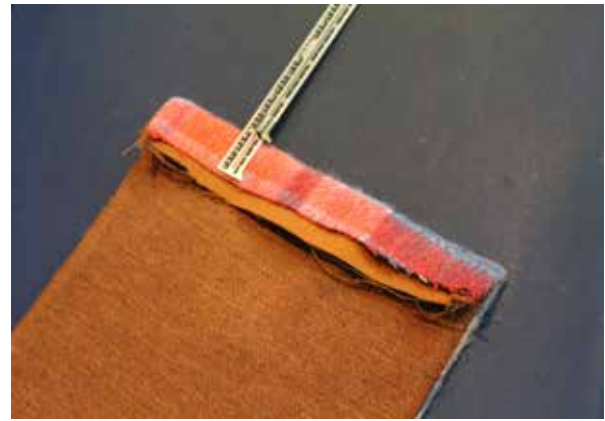
Fold back top, or unstitched edge by 1 inch and press