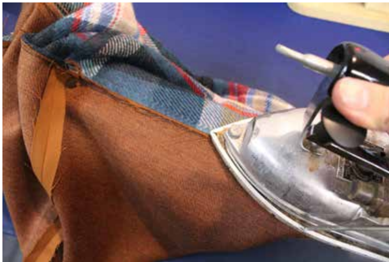
Press open centre front seam on hood