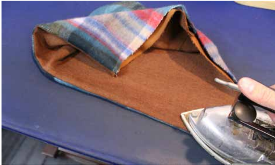
Press hood centre front Seam flat