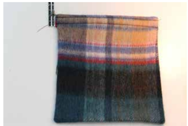
Edge stitch at 1/4 and top stitch at 3/4