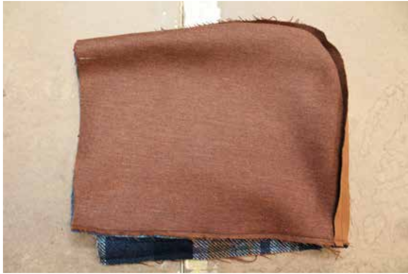
Hood shown with self and lining sewn together at CF seam