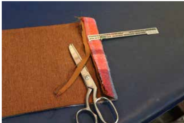
Trim back lining