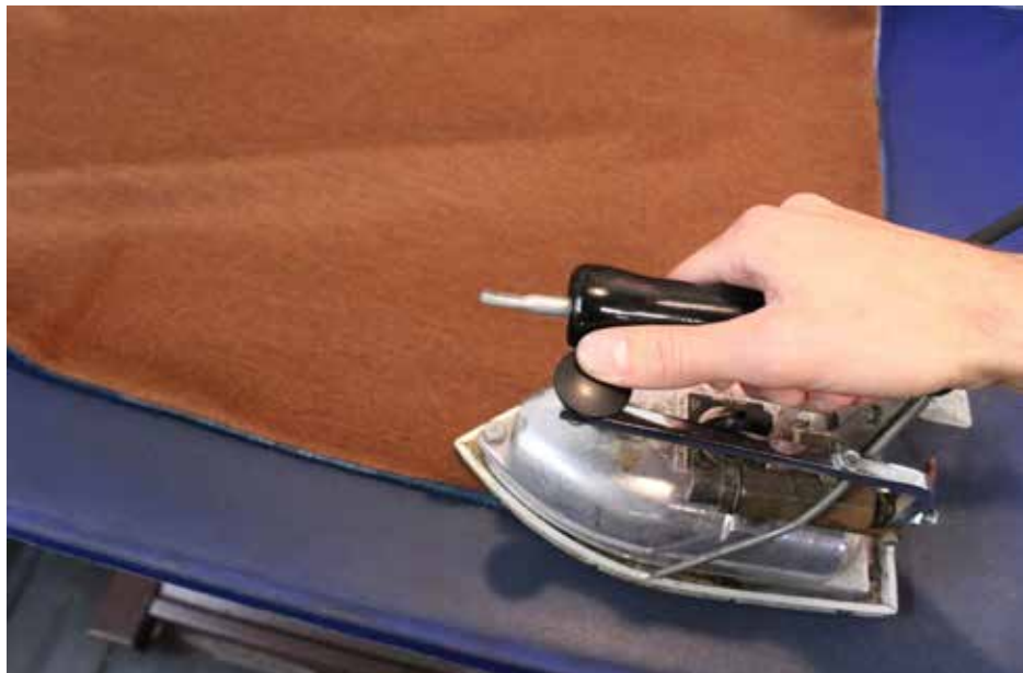
Turn out and press flat