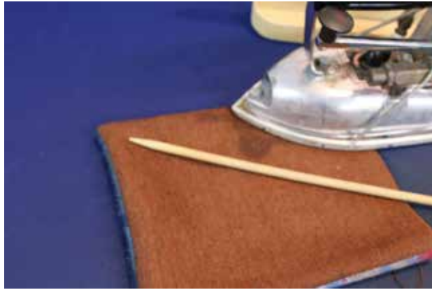
Turn out and use a pointed object to push out corners and press